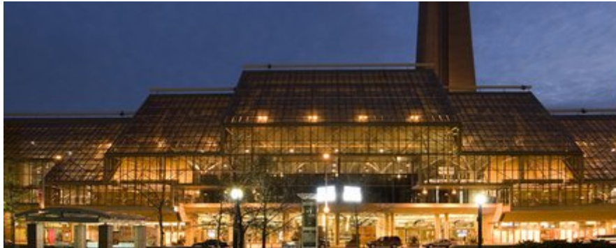
Sheraton Center Hotel, Downtown Toronto – Next to the City Hall