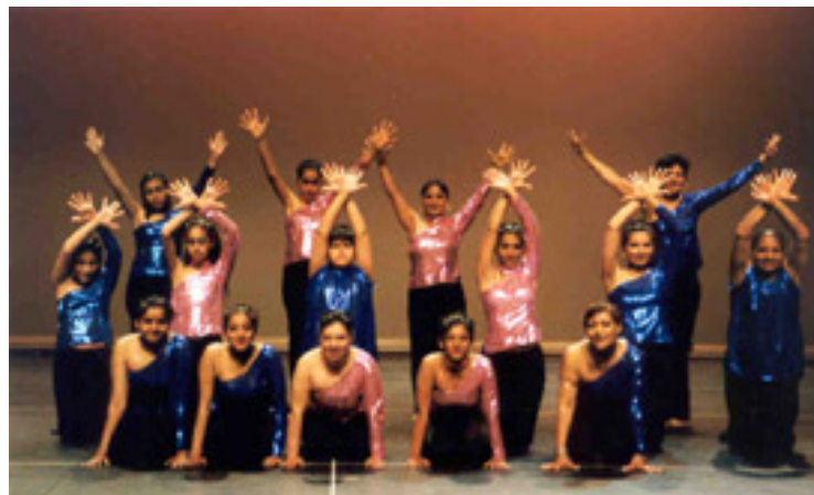
World-Famous Shiamak Davar Group of Mississauga, Ontario – Bollywood & North American Fusion