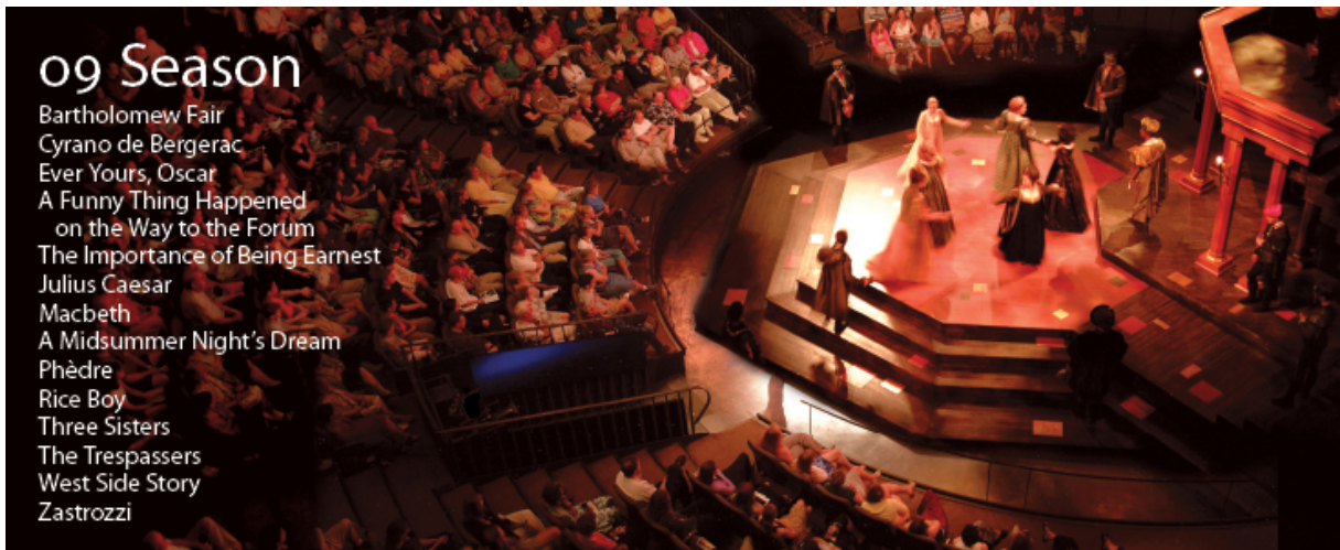
Stratford Ontario Theatre Scene – 2 hours away