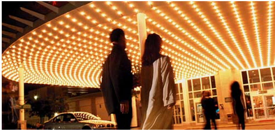
Niagara Falls Casino – 90 minute away